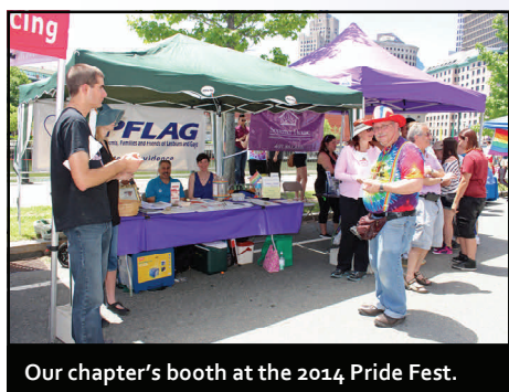
Our chapter's booth at the 2014 Pride Fest.

The Illuminated Night Parade kicks off at 8:45pm , and winds through the streets of downtown Providence.