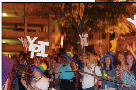
Photos from the 2104 RI Pride Illuminated Night Parade.